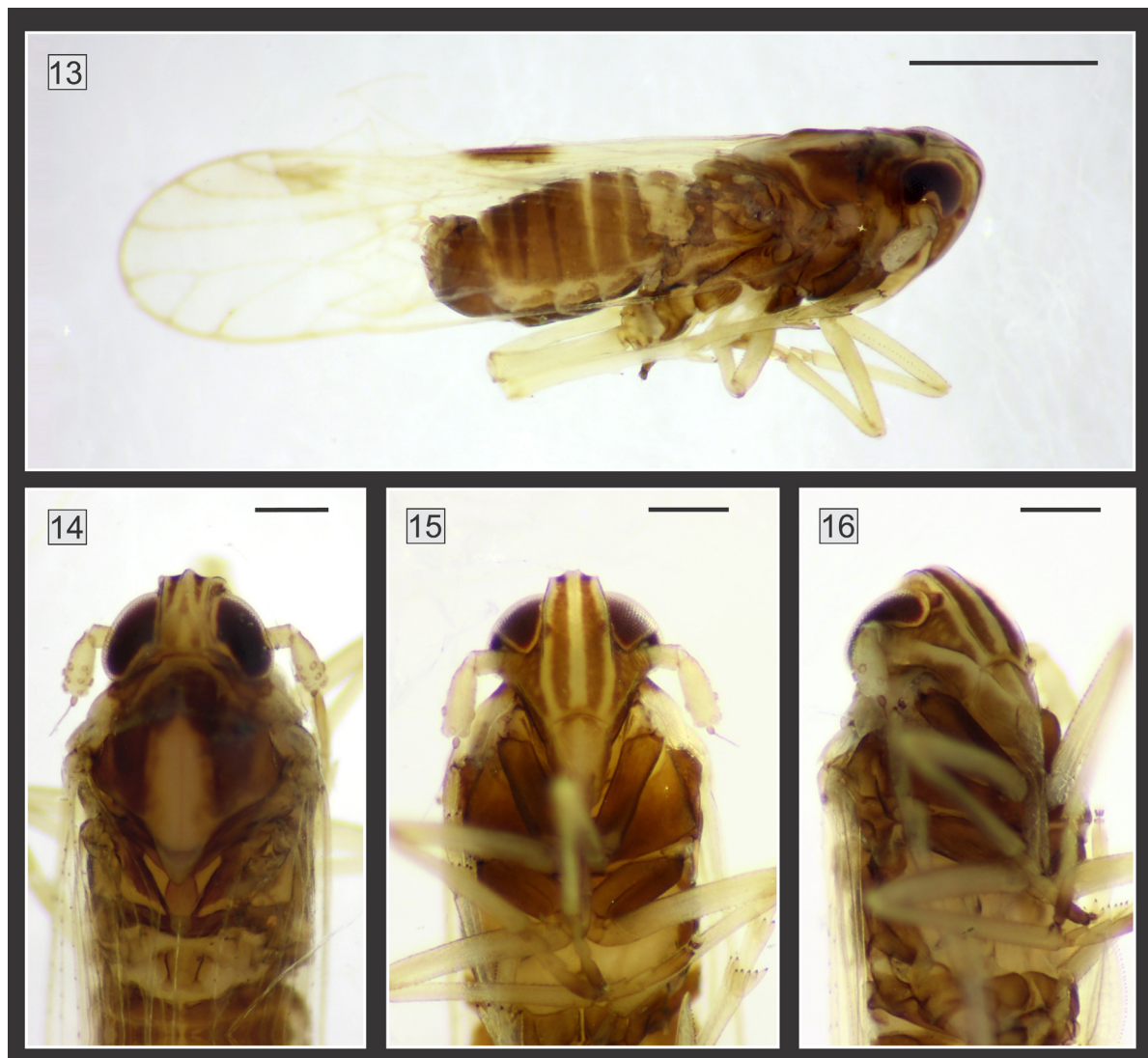
Figs. 13–16. Sogatella unidentata sp. nov. male holotype: (13) habitus, lateral view; (14) head and thorax, dorsal view; (15) head, frontal view; (16) head, ventro-lateral view (Scale = 1 mm, figure 13; Scale = 0.2 mm, Figs. 14–16).

Diagnosis: S. unidentata sp. nov. can be distinguished from the most closely allied species by the combination of the following