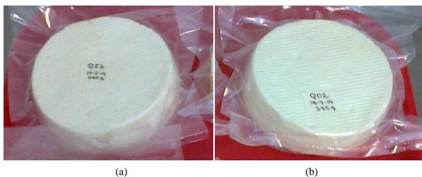
Figure 2. Development of cheeses which include in its composition inulin (IC) and oligofructose (OC) respectively. (a) IC vacuum packed; (b) OC vacuum packed.