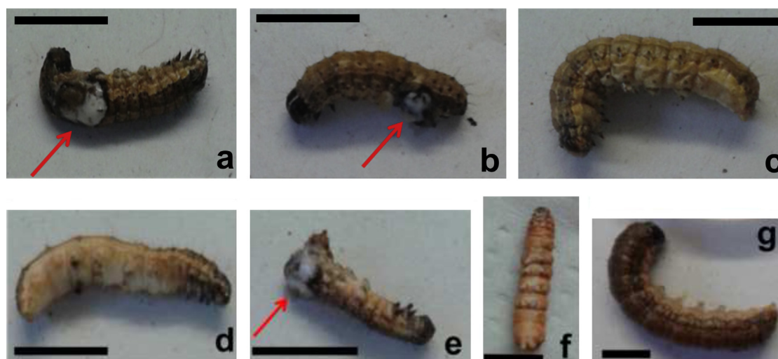
Figure 1 Symptoms shown by S. frugiperda larvae infected with SfGV ARG at different times post infection and with different doses: 17 dpi, 1 \times 10^4 OB/ml (A); 12 dpi, 1 \times 10^6 OB/ml (B); 21 dpi, 1 \times 10^4 OB/ml (C); 14 dpi, 1 \times 10^8 OB/ml (D); 14 dpi, 1 \times 10^8 OB/ml (E); 28 dpi, 1 \times 10^9 OB/ml (F); 14 dpi, uninfected control. dpi: days post infection. Black bar: 0.5 cm. Red arrows indicate injuries in the last abdominal segments.

region of Argentina, which was designated as SfGV ARG. In order to characterize this virus and confirm its identity, three-day-old S. frugiperda larvae were orally infected to amplify the virus and get evidence of infection symptoms. Infected larvae died after at least ten days regardless of the dose used, and on occasions death occurred after about 20 to 30 days, suggesting that SfGV ARG is a type 1 granulovirus due to the slow killing time in comparison to type 2 GV. Infection symptoms included a yellowish-orange coloration and a swollen larva body (Fig. 1). Typically, dead larvae did not show liquefaction, suggesting the absence of the cathepsin gene, as it happens in the Colombian isolate SfGV VG008 4 . Furthermore, in some cases dead larvae showed conspicuous severe injuries in the last abdominal segments (Fig. 1a, b, e). Samples of these injuries were observed using dark field microscopy where plenty of granulovirus OBs were apparent (not shown). Betabaculoviruses are classified as type 1, 2 or 3: type 1 are slow killing viruses, generally infecting the fat body of the larva whereas type 2 are polyorganotropic, fast killing viruses 5 . Available data regarding other SfGV isolates suggest that this is a type 1 betabaculovirus: Colombian and Brazilian SfGV isolates have been studied showing mean times to death (MTD) of 29 days and 33 days, respectively, confirming that this virus is a slow-killing betabaculovirus 3 .