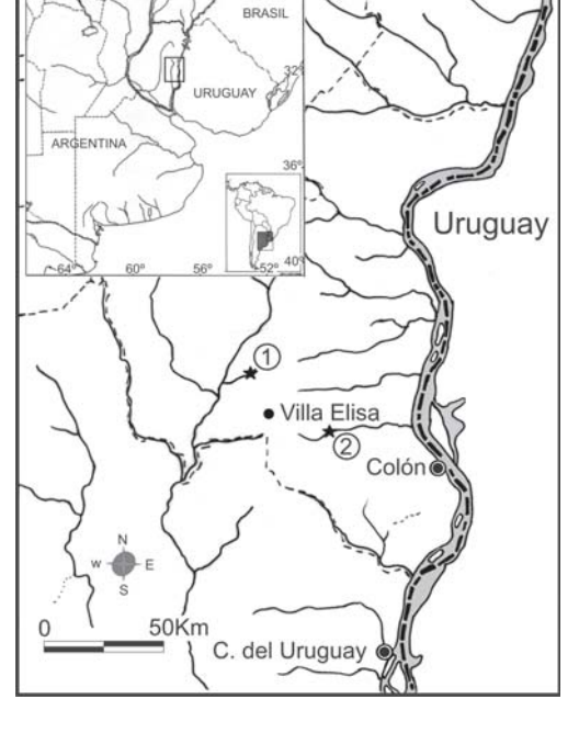
Fig. 1. Sampling localities of sigmodontine nests in eastern Entre Ríos province, Argentina: 1- Río Gualeguaychú and 2- Arroyo Perucho Verna.

Nests were attributed to H. brasiliensis whenever this species could be observed inside the constructions. Although Oligoryzomys nigripes and O. flavescens were captured using traps around nesting sites, presence of individuals inside nests was not observed directly. For this reason, hair was collected from the nests and the taxa identified based on the techniques described by Chehébar and Martín (1989). For this, hair were immersed in hydrogen peroxide during five minutes, then immersed in ether during the same lapse of time, dried under a lamp, and finally placed in glycerine on a slide. The structure of the hair medulla was then evaluated with an optic