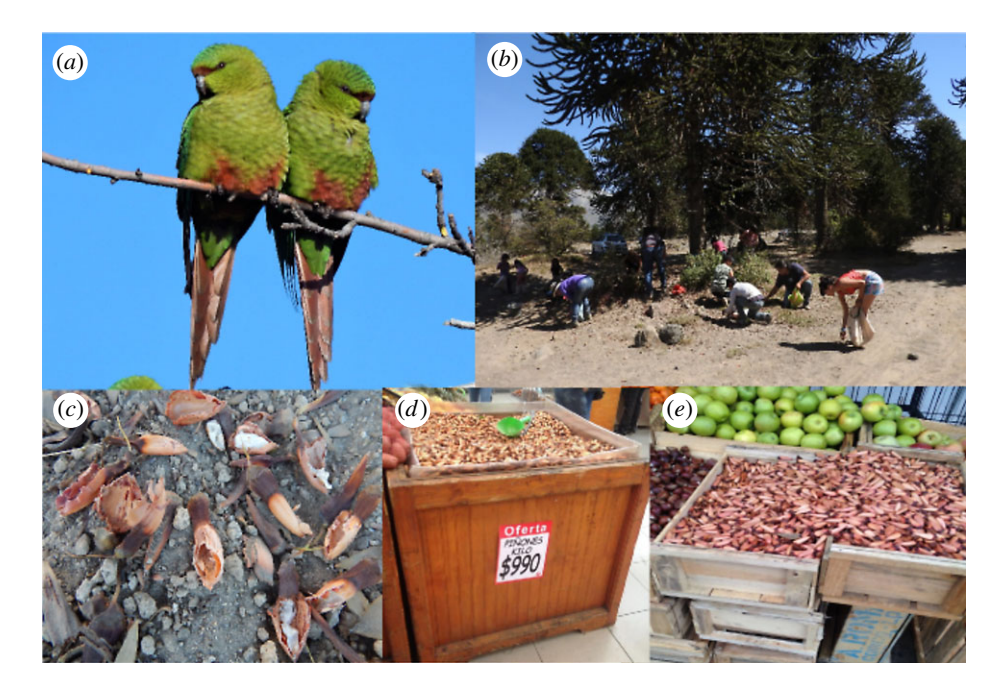
Figure 1. (a) Austral parakeets perching on Araucaria araucana. (b) Group of gatherers collecting seeds. (c) Seeds commonly found on the ground, intact, partially eaten and completely eaten by parakeets. Araucaria araucana seeds sold in markets in (d) Chile and (e) Argentina.

The seeds are rich in carbohydrates, particularly starch [31], and germinate soon after dispersal, which coincides with the onset of the rainy season [32]. Thus, the large, recalcitrant seeds of A. araucana do not form a persistent seed bank and recruitment depends on the number of seeds produced and surviving each year [33]. A. araucana is shade tolerant when young, germinating in any type of microhabitat, including the ground under the maternal tree [18,25,34,35]. In fact, in a recent study we recorded a total of 3305 saplings and 550 young trees growing under the putative parental trees, when carefully inspecting under the canopy of 516 female A. araucana trees [21].