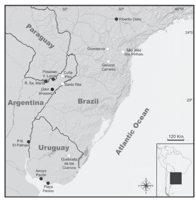
Fig. 1. Map showing the localities of the recorded specimens. White dots: Scinax aromothyella ; Black dots: S. berthae .

1962; Faivovich, 2005; Kolenc et al., 2007). In this study we investigated and compared the advertisement calls of these closely related and allopatric frogs, recorded at several localities throughout their distributional ranges.