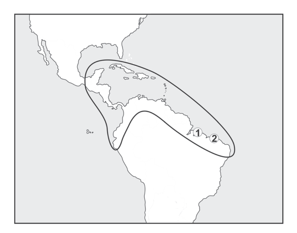
Fig. 1. Schematic map of Central America and northern South America. The outline of the Baitoan or Miocene Caribbean Province, according to Woodring (1971, 1974), Petuch 1982, 1988, 2003) and Vermeij (2005) is indicated by a thick black line. 1. Location of the rich fossiliferous assemblages of the Pirabas Formation. 2. Southern limit of the fossiliferous assemblages (impoverished) (Ferreira 1970; Távora et al. 2010).

As detailed below, the age of the Pirabas Formation has been established on paleontological grounds, and has been subject to one imprecise attempt at numerical dating (Belúcio & Távora 2001). White (1887) assigned a Cretaceous age to some beds of the Pirabas Formation. The dating was questioned by WOODRING (1926) and OLIVEIRA (1953) who noted that WHITE (1887) had mixed fossils and localities thus resulting in erroneous interpretations. In a brief note, Maury (1919) proposed a Tertiary age for the Pirabas beds, and suggested preliminary correlations. Later, in her classic monograph, Maury (1925), assigned an Early Miocene age to the Pirabas beds, mainly based on the presence of the gastropod Orthaulax pugnax (Heilprin 1887) (see also Cooke 1922). This age was overlooked for many years.