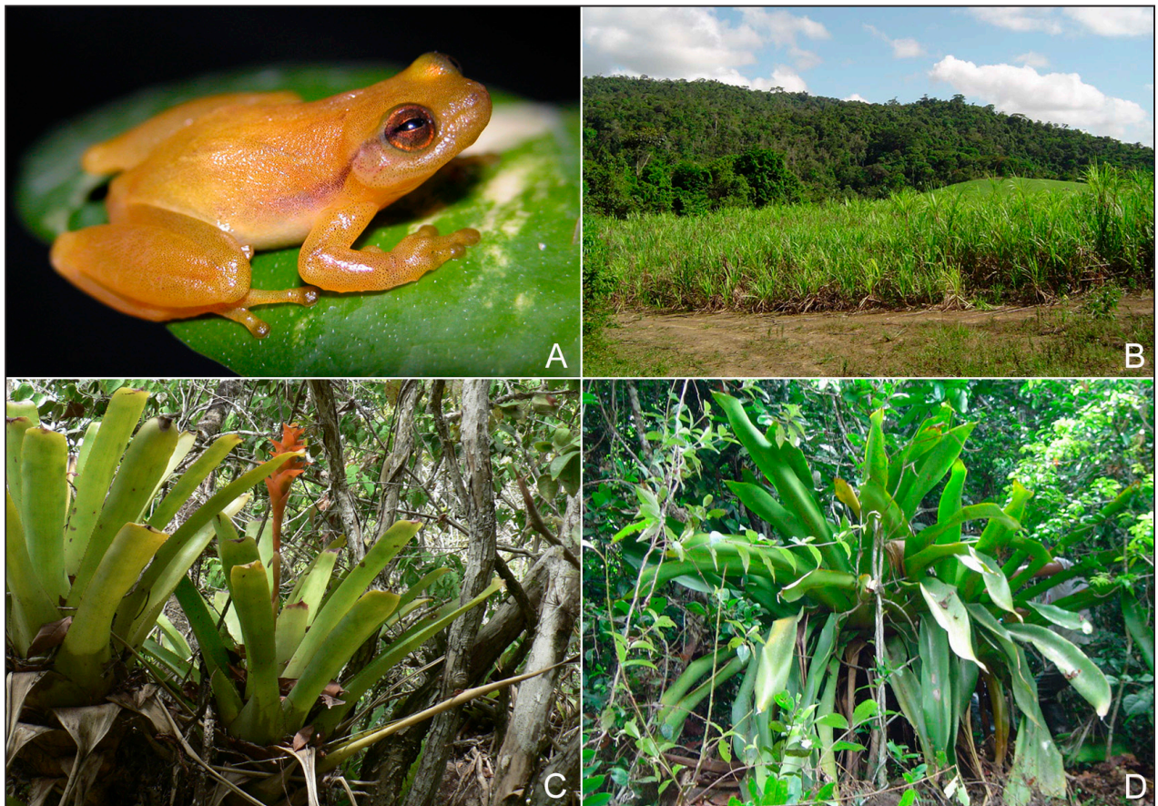
Figure 2. (A) Adult of Phyllodytes edelmoi in life (unvouchered specimen). (B) A remnant of the Atlantic Forest of Serra da Saudinha, surrounded by sugar cane crops. (C) and (D) Habitat of P. edelmoi .

the plants. Three genera of bromeliad plants were identified in the area studied: Aechmea , Canistrum ( C. alagoanum and C. aurantiacum ), and Hohenbergia (Fig. 2C, D). For each bromeliad, we calculated the volume (in cubic meters) using the formula: V = \pi \text{ radius}^2 \text{ height} / 3 , where radius was the distance between the central axis and the longest leaf, and height was the distance from the root base to the tip of the longest leaf. Ten agglomerates of bromeliads (41 bromeliad plants) were examined totalizing a volume of 33.95 m 3 in the rainy season (August and September, 2004 and April, 2005) and eight agglomerates (19 bromeliads plants) with a volume of 30.18 m 3 in the dry season (October and November, 2004 and January, 2005). Although the number of bromeliad was different among seasons, the total volume of bromeliads analyzed was similar standardizing the sampling effort.