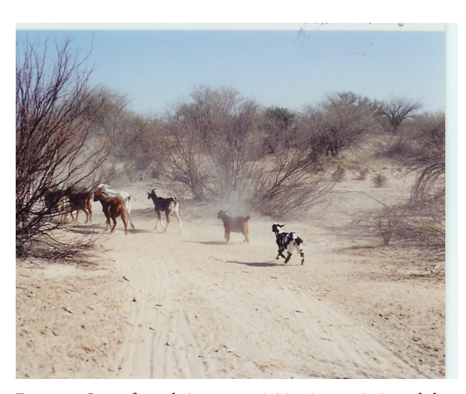
Figure 3: Goats for subsistence activities in non-irrigated dryland