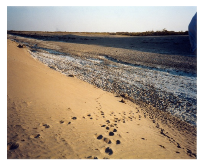
Figure 6: Dry bed of the Mendoza river in the lower basin