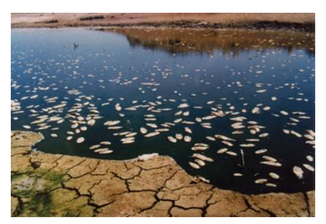
Figure 5: Drying of Guanacache Wetland (Ramsar site)