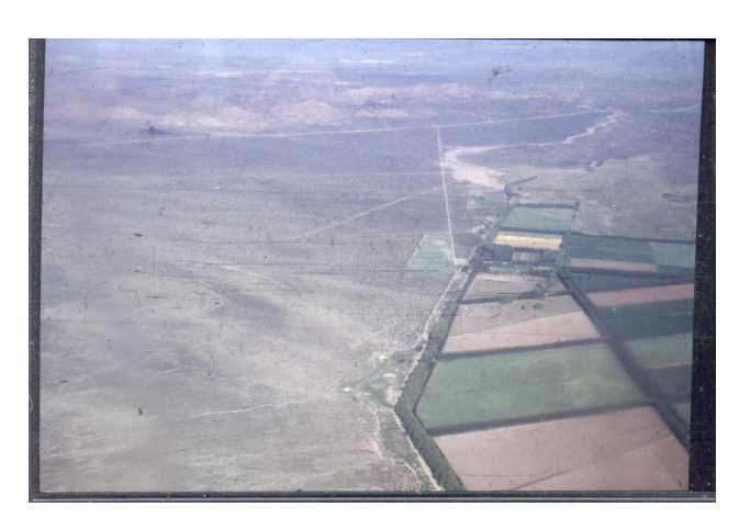
Figure 4: The border between irrigated drylands (oasis) and non-irrigated (desert)