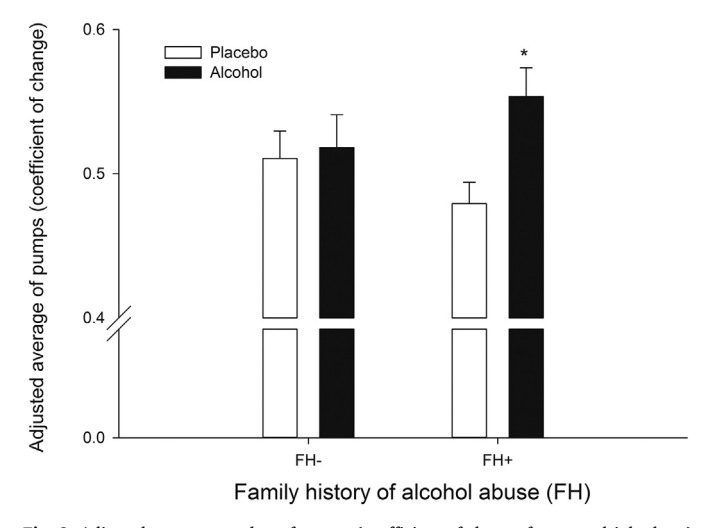
Fig. 3. Adjusted average number of pumps (coefficient of change from pre-drink phase) on the BART in participants with and without a family history of alcohol problems (FH + and FH -, respectively) who were given an alcohol (0.6 and 0.7 g/kg, women and men, respectively) or placebo drink. The asterisk indicates a significant difference between the FH + group that was given alcohol and the FH + group that was given placebo. The data are expressed as mean \pm SE.

research in this area were conducted in North America. The influence of personality-related risk factors in this population may not apply to individuals with different cultural backgrounds. It is important to include a diverse array of geographical and cultural groups when analyzing psychological variables that are related to alcohol consumption (Henrich, Heine, & Norenzayan, 2010). Tolerance can also be measured at different levels of analysis and either during the initial response to the drug or during later time-points of the BAC curve when adaptations (e.g., acute tolerance; Morzorati et al., 2002) can occur.