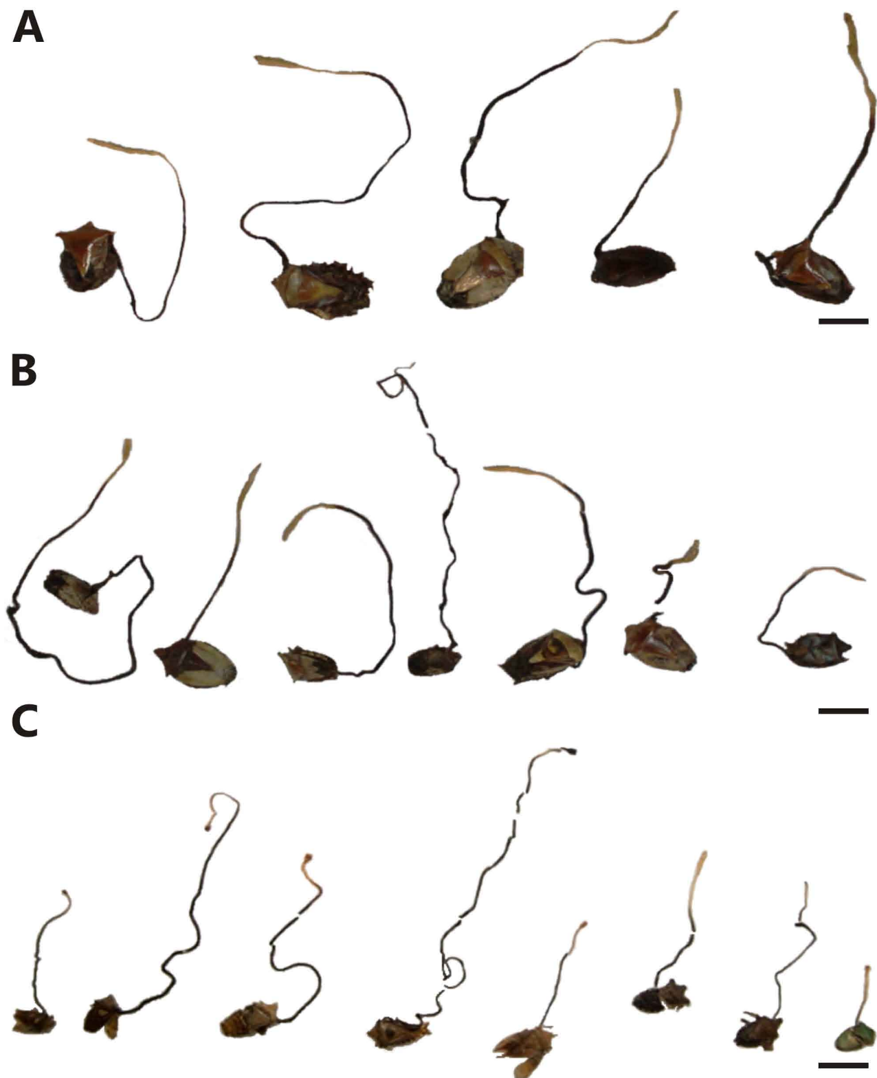
FIGURE 4. Ophiocordyceps neonutans versus O. nutans : (A, B) Brazilian specimens of O. neonutans ; (C) Japanese specimens of Ophiocordyceps nutans (scale bar = 15 mm).