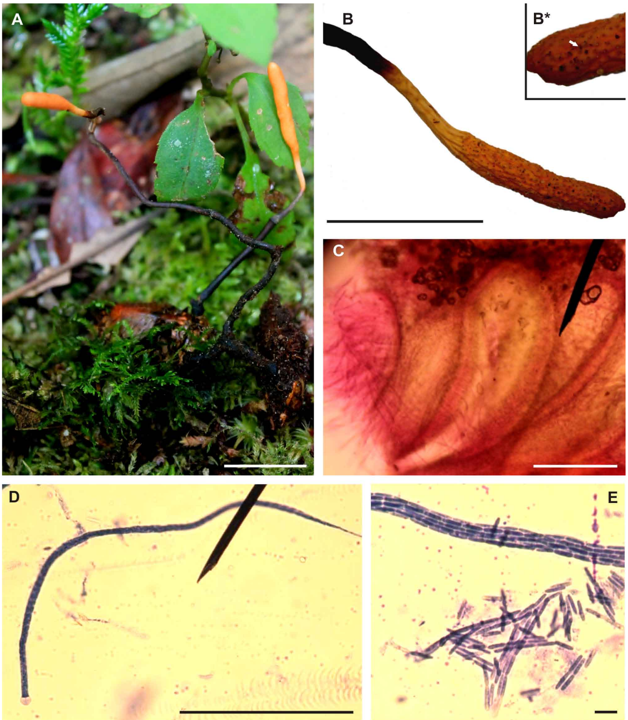
FIGURE 3. Ophiocordyceps neonutans : (A) a specimen in the field, (B) enlarged head with (B*) brown ostioles, (C) perithecia, (D) mature ascus with ascospores, (E) fragmented part spores. (scale bar: A, B = 15 mm, C, D = 300 \mu m, E = 15 \mu m).