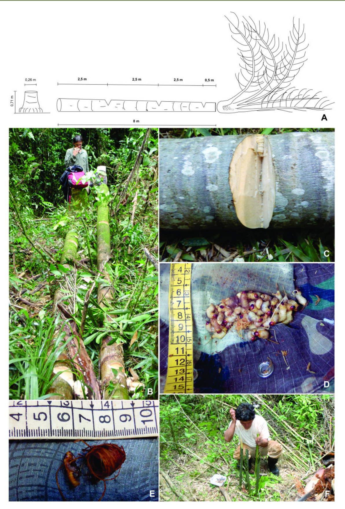
Figure 3. A: Schematic of a felled pindo yky guachu palm tree with three transverse incisions along the stem. B: two specimens of felled pindo yky guachu . C: detail of wedge-shaped incisions made in the stipe. D: collected ycho'i larvae. E: Metamasius hemipterus pupa and cocoon. F: Merostachys claussenii bamboo stem used to transport larvae.