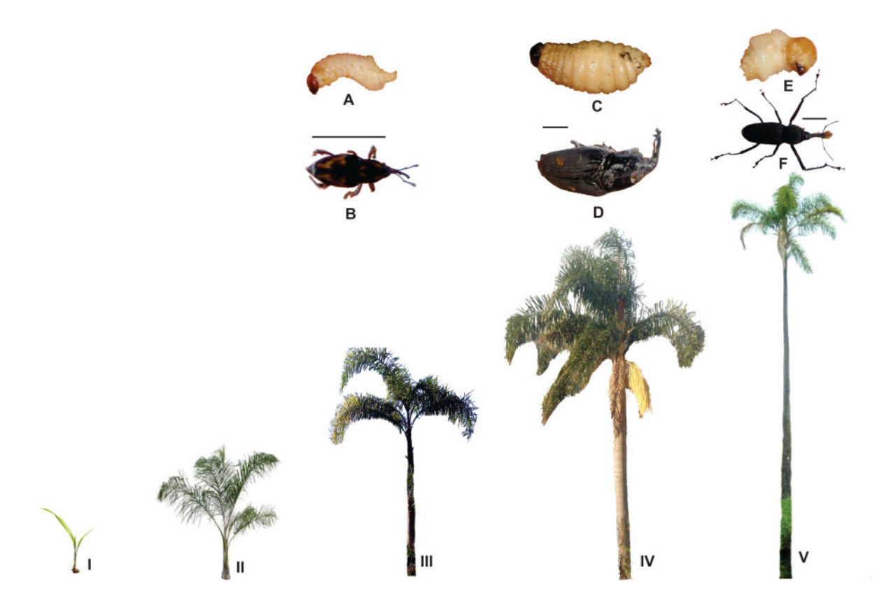
Figure 2. I-V: Palm tree Syagrus romanzoffiana in its five stages of growth according to the local classification. A and B: larva and adult insect of Metamasius hemipterus beetle produced at stage III (scale-1 cm). C and D: larva and adult insect of Rhynchophorus palmarum weevil obtained in stage IV (scale-1 cm). E and F: larva and adult insect of Rhinostomus barbirostris beetle developed in stage V (scale-1 cm).