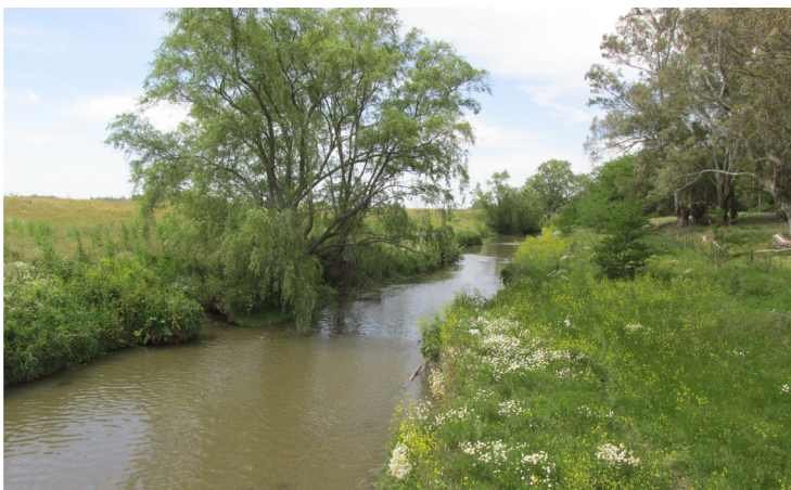
Figure 2 - Langueyú stream reach, where specimens of Hypostomus commersoni were collected. The southernmost occurrence of this species (36°55'38.66"S, 58°56'8.70"W).