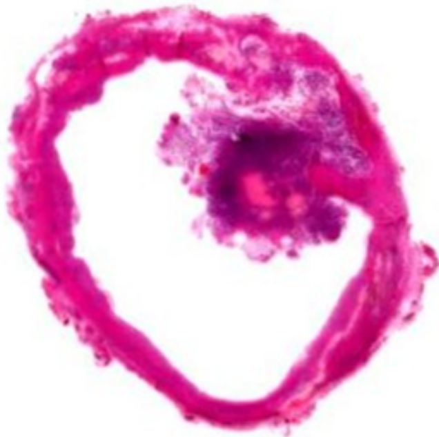
Figure 1. Macrocopy of TGD cyst with carcinoma in the wall.