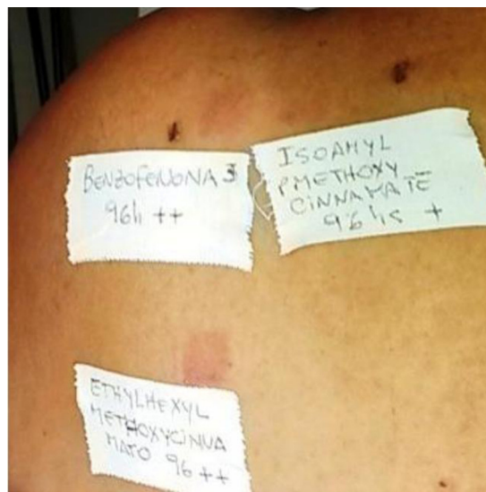
Figure 5 Reactions in the irradiated area to oxybenzone and to 2 cinnamates, thus confirming PACD to organic sunscreens. These were replaced by physical sunscreens.

Oxybenzone is a compound that absorbs in the range 290-340 nm and is widely used in cosmetics, as well as in industrial products (Fig. 5). This aromatic ketone is soluble in organic solvents and insoluble in water. It can cross the skin barrier and its metabolites are excreted in urine after extensive topical application. 19 It was named allergen of the year in 2014 by the American Contact Dermatitis