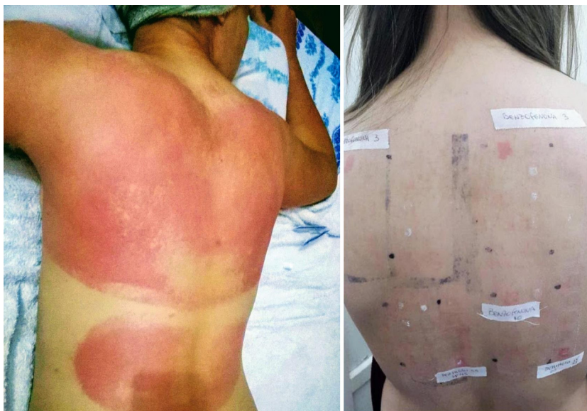
Figure 4 Patient with photosensitive reaction after exposure to sunlight with pediatric sunscreen. Patient with a history of intolerance to cosmetics. After the test, the patient had a photosensitivity reaction to benzophenone-10 and reaction in the irradiated area and nonirradiated area to benzophenone-3, both of which are components of the sunscreen.

patch test without irradiation. 14 The authors believed that in countries such as Belgium, France, Spain, and Italy, the rates of sensitization to octocrylene are higher because of the more frequent use of topical ketoprofen, which may act as a sensitizer and in turn generate cross reactions. Thus, an increase of 0.7% is observed in ACD and 4% in PACD to octocrylene in the patients studied, but this agent is not considered a main sensitizer.