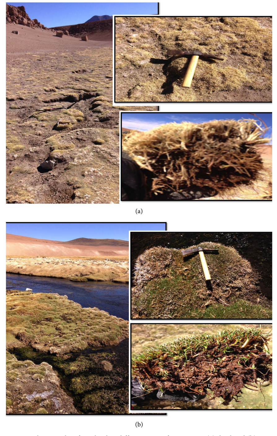
Figure 1. Photographs of peatland in different state of preserving: (a) dead and (b) active peatland.

(%) was carried out by standard methods in pH7 diagnóstico agrícola.