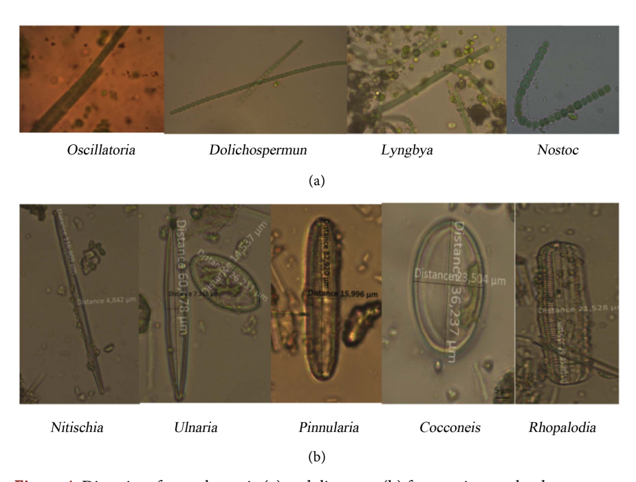
Figure 4. Diversity of cyanobacteria (a) and diatomea (b) from active peatland.

these environments, it can be proposed that the loss of water causes great changes in the physical-chemical characteristics of the soil, which leads to a modification of the microbiota.