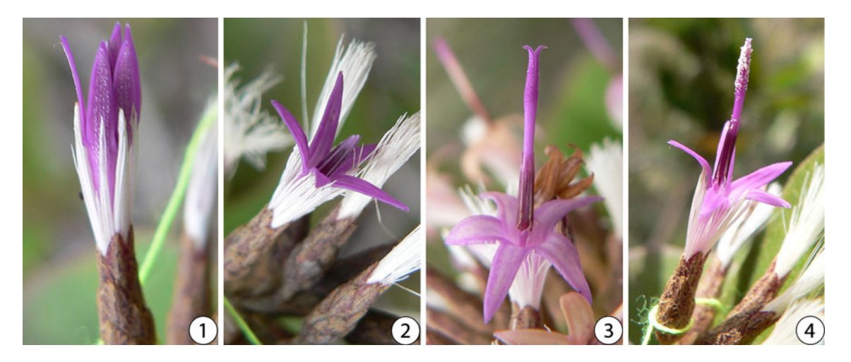
Figs. 1–4 Floral events in P. kingii. 1 Beginning of anthesis. 2 End of anthesis (pre-anthesis). 3 Functional male phase. 4 Functional female phase

The landscape in this region is dominated by a type of savanna known as Campos rupestres (rocky fields) located at elevations over 900 m a.s.l. Herbaceous and shrubby vegetation grows in the shallow, sandy, acid, and nutrient-