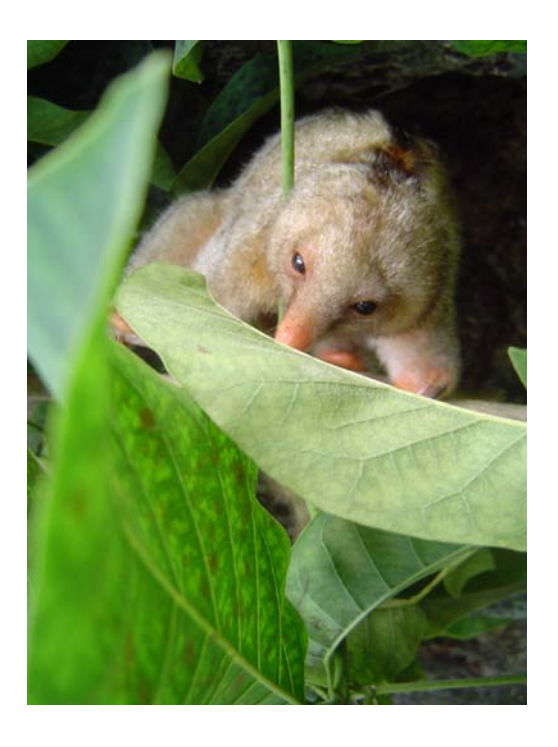
Fig. 1. Male silky anteater ( Cyclopes didactylus) from Recife, Pernambuco, Brazil.