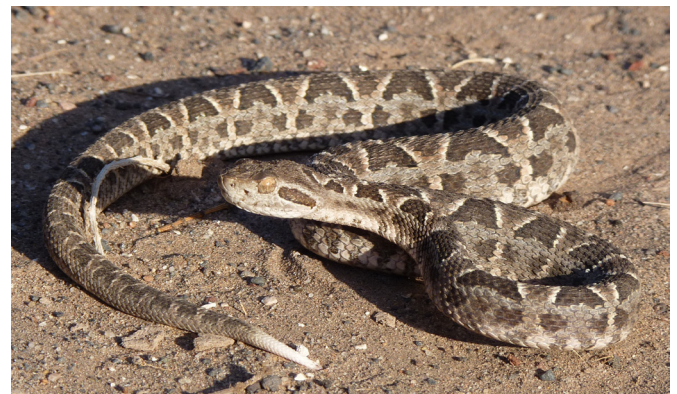
FIGURE 2. Bothropoides diporus from 3.9 km S of Provincial Road 6, Pehuenches Department, Neuquén province, Argentina (LJAMM-CNP 14279).