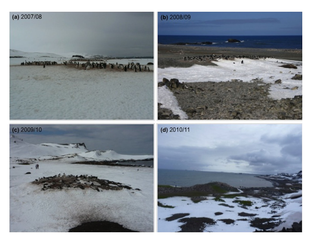
Fig. 2 Interannual comparison of local conditions recorded at the Stranger Point colony, from 2007/08 to 2010/11: (a) 2007: first week of November; (b) 2008: 10 November; (c) 2009: 5 December; (d) 2010: last week of November.