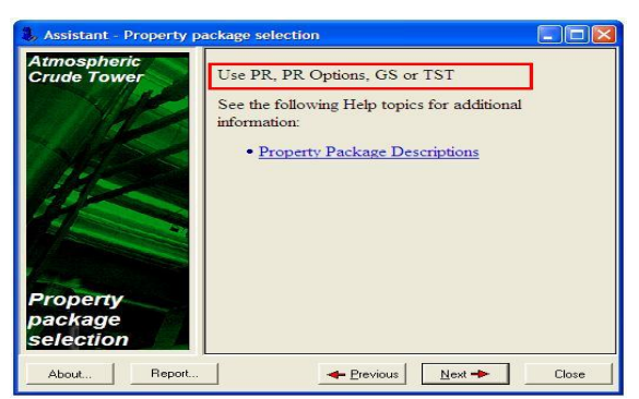
Fig. 1–5: Required steps for accessing to the Aspen Hysys V 7.2 recommended packages.

Aspen Plus recommends thermodynamic packages, designed for HC and light gases, including models for the LVE and liquid fugacity correlations, which are used for medium and low operating pressures. The 'Petroleum tuned' EOS are used for high values of pressure. Where possible, density and transport property values are calculated based on the procedure of API (American Petroleum Institute).