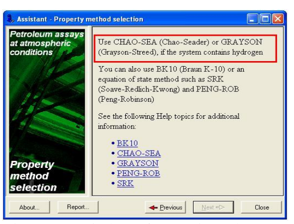
Fig. 6–10: Required steps for accessing to the Aspen Plus V 7.2 recommended packages.