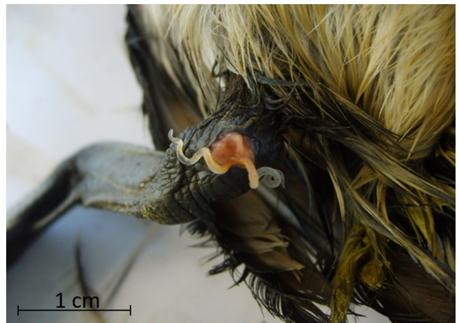
Figure 2. Pelecitus fulicaeatrae removed from tibiotarsal-tarsometatarsal articulation.

should be performed in Podicipedidae to adequately elucidate their parasite fauna.