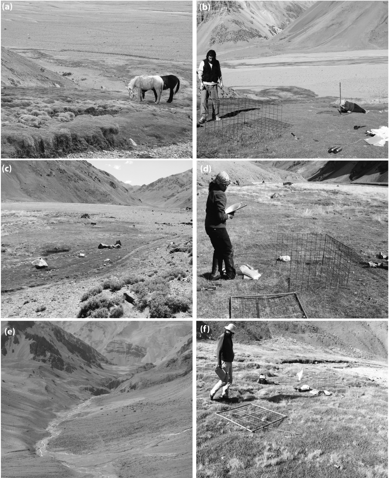
FIGURE 2. General view of the three meadows (left) and of an enclosure in each alpine meadow at the end of the experiment in March 2011 (right) in Aconcagua Provincial Park. (a, b) Meadow 1, (c, d) Meadow 2, and (e, f) Meadow 3.

species. Multiple hits per point were possible where different species occurred at the same point. The number of points that touched litter underneath living vegetation was also recorded. These data were