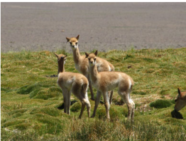
Figure 3. Three 3-week-old vicuñas with attached ear-tag transmitters, in San Guillermo National Park, Argentina, January 2010.

The hand-capturing method described here was an efficient mean of handling and marking neonatal vicuñas. Successful application of this technique was likely based on terrain and vegetative conditions (flat with short grass), high densities of animals for monitoring (particularly in the meadow), and