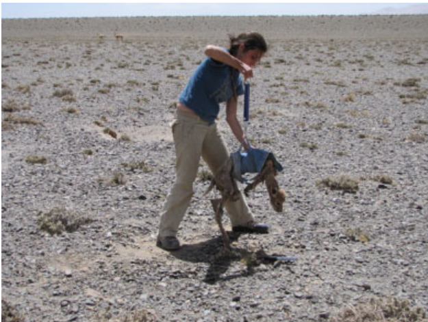
Figure 2. Weighing a 10-minute-old hand-captured vicuña at San Guillermo National Park, Argentina, January 2010.

close to where the mother was last observed. Reuniting was considered successful when 1) the female led the neonate away, or 2) the female ran from sight during capture, but the neonate was observed the next day accompanied by, or nursing from, an adult.