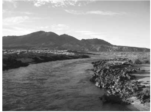
Fig. 1. Collection site of Prosopanche bonacinai and its associated weevils in the genus Hydnorobius , sand margins of Río Grande in the locality of "El Zampal" (Mendoza). Note the black volcanic rocks present on the shores.

While conducting a field trip to Southern Argentina in February of 2007, plants of Prosopanche bonacinai were found in a site called "El Zampal" in the South of Mendoza province (Fig. 1). Individuals of this plant were found on the sandy shores of Río Grande, and adjacent to volcanic rocks (Figs. 1, 2). This was an unexpected discovery, since no records for Prosopanche (and their associated oxycorynine weevils) were known for that region. The plants were dug out and kept in bags for further inspection in the laboratory. Adults of Hydnorobius of two different species, H. parvulus (Fig. 3) and H. hydnorae (Fig. 4), were found in the collected plants. They were identified using Kuschel's (1995) key and by comparison with reference specimens of the three Hydnorobius species, including types from the Bruch collection, from the "Museo Argentino de Ciencias Naturales" (MACN). The association of Hydnorobius hydnorae with Prosopanche bonacinai is herein documented for the first time; it also represents a new distribution record. Because Hydnorobius hydnorae had been previously collected only on Prosopanche americana , along its wide geographical range in Central and Northern Argentina, it was thought to be host-species specific. With this new record, the host plant range of Hydnorobius hydnorae now includes both species of Prosopanche , indicating that this weevil, like many other phytophagous beetles, may be preadapted or may have evolved to develop in a new,