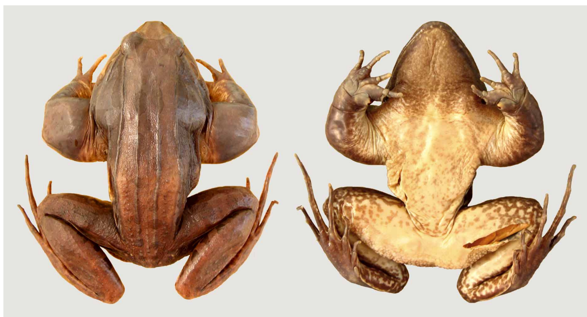
FIGURE 2. Leptodactylus latrans (Steffen, 1815), neotype (MNRJ 30733; 107.0 mm SVL), dorsal and ventral views.

Color: In preservative, general dorsal background color reddish gray; a distinct interocular black spot with two posterior lobes; scattered, rounded black spots on dorsum; a black spot on posterior side of arms; black spots, aligned across the dorsal surfaces of thighs, tibiae, and feet. A black stripe on canthus rostralis, between the nostril and the anterior corner of eye; loreal region uniformly gray, bordered below by small black, approximately triangular spots; border of maxilla gray with light gray spots. Ventral region white with scattered, unshaped small clear gray spots; gular region gray.