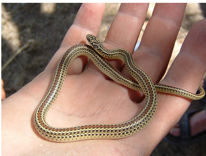
FIGURE 1. Philodryas agassizi from the northern rocky shore of the Colorado River, Lihue Calel department, La Pampa Province, 2.3 km W Pichi Mahuida, Pichi Mahuida Department, Río Negro province, Argentina (LJAMM-CNP 4538).

south of Lihue Calel and Sierra de la Ventana Mountains (Viñas et al. 1989). The record from La Pampa province was obtained during a field expedition carried out on January 19, 2004 when an adult specimen of Philodryas agassizi (SVL = 33.5 mm, Figure 1) was collected on the northern shore of the Colorado River, along the provincial limits between La Pampa and Río Negro provinces. Collection locality is in the Lihue Calel Department, La Pampa, (38°49'00" S, 64°57'00" W), a desolate site in La Pampa province, with the closest human