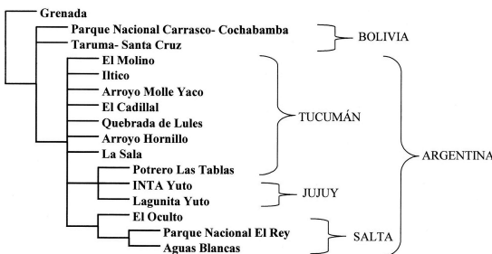
Fig. 2. Strict consensus tree of An. pseudopunctipennis from localities in Argentina (Salta, Jujuy and Tucumán) and Bolivia.

In the cladistic analysis six equally parsimonious trees were obtained of 4,608 steps in length, with consistency and retention indices of 0.91 and 0.82, respectively. The strict consensus of these trees (Fig. 2) depicts the Bolivian populations (Tarumá and Parque Nacional Carrasco) as more basal (ancestral), sister of the node that includes all the Argentinean populations (Salta, Jujuy and Tucumán) consisting of a polytomy that includes 7/8 of the Tucumán localities (Arroyo Mole Yaco, El Cadillal, Quebrada de Lules, El Molino, Iltico, Arroyo Hornillo and La Sala), a clade that includes a mixture of Jujuy (INTA Yuto and Lagunita Yuto) and Tucumán (Potrero Las Tablas) localities and finally a clade that contains the Salta localities (El Oculito, Parque Nacional El Rey and Aguas Blancas).