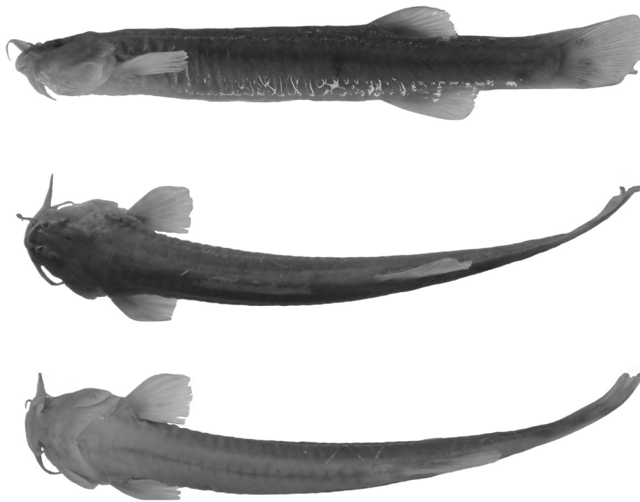
Fig. 1. Silvinichthys pedernalensis n. sp., holotype, FACEN 0071, 45.1 mm SL.