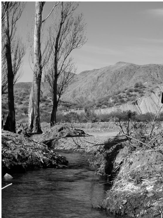
Fig. 3. Type locality of Silvinichthys pedernalensis . Río Pedernal, Sarmiento, Provincia San Juan, Argentina.

Fig. 3. Localidad tipo de Silvinichthys pedernalensis . Río Pedernal, Sarmiento, Provincia San Juan, Argentina.