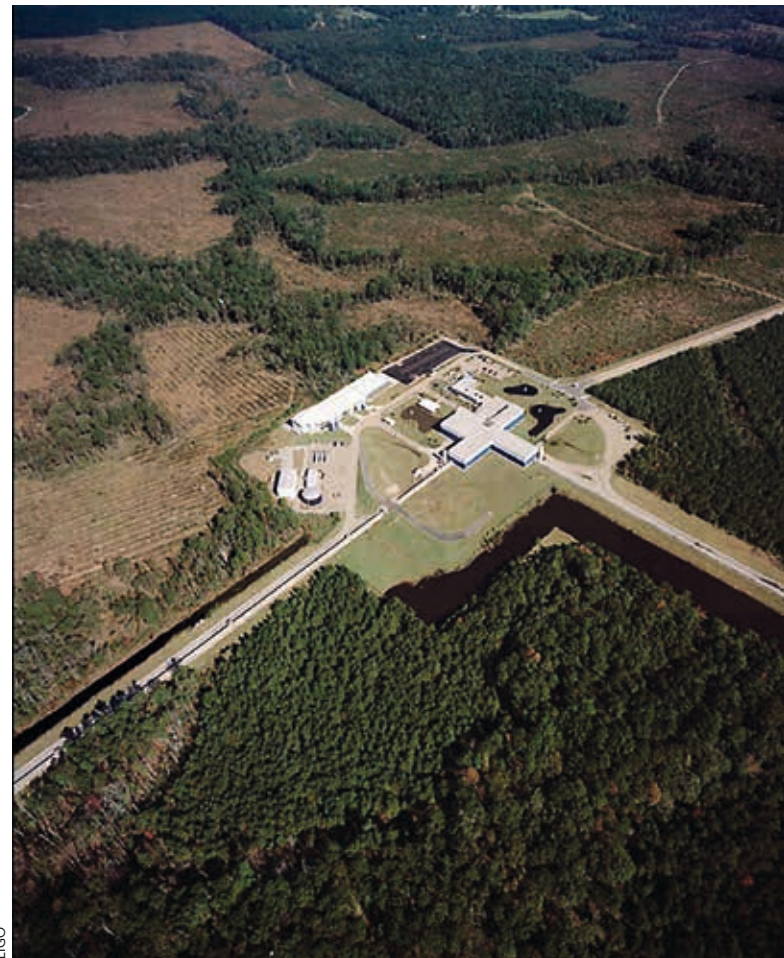
On 15 September 2015, the LIGO observatory detected the existence of gravitational waves for the first time. These detections have important scientific, as well as philosophical, implications: they can help us show that the philosophical doctrine that states that only the present exists (presentism) is false.

Interferometer Gravitational-Wave Observatory) reported the direct detection of gravitational waves for the first time. The announcement, made on February 2016, refers to the event registered on 14 September 2015, identified with the code GW150914. Gravitational waves were detected due to the fusion of two black holes with masses 36 \pm 5 times and