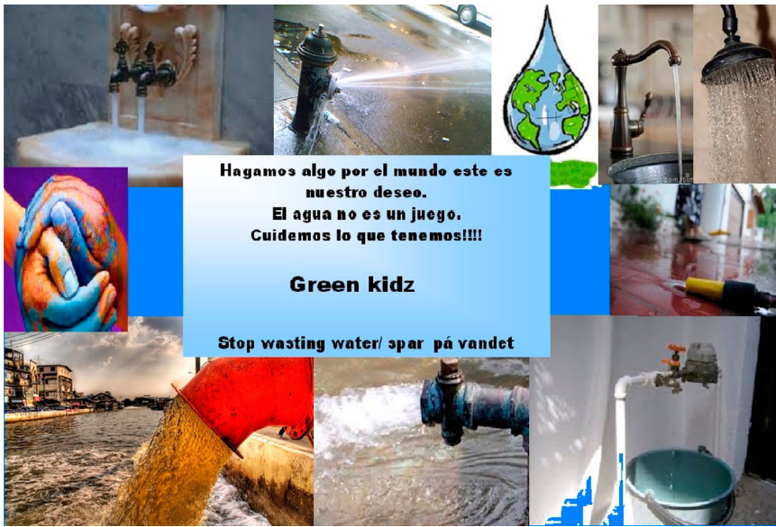
Figure 6. Collaborative poster between the Argentinian and Danish children in English, Spanish and Danish.