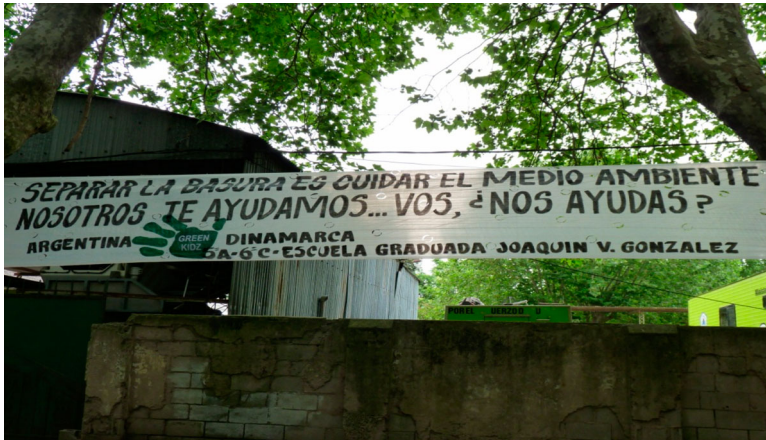
Figure 8. Civic action in the community (citizenship dimension of the project): Banner in the primary school in La Plata, Argentina. The banner can be seen in the newspaper article in Figure 7.