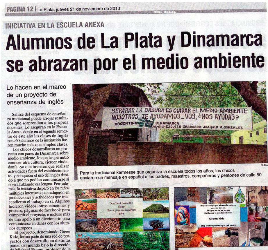
Figure 7. Civic action in the community (citizenship dimension of the project): Article about the project in the local newspaper (in the city of La Plata, Argentina) after the children had been interviewed by a local journalist. The posters that the Argentinian and Danish children produced in collaboration can be seen in the article. The banner in Figure 8 can also be seen there.