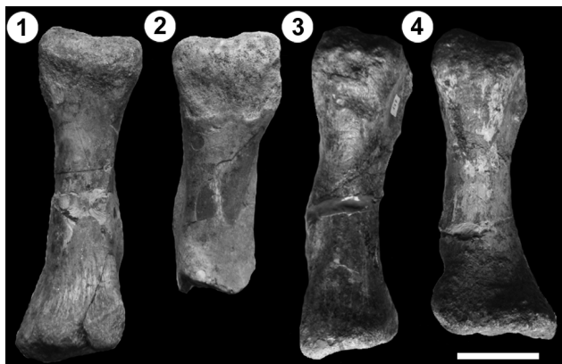
Figure 4. Metatarsals in dorsal view. 1, 3, morphotype 1: 1, left metatarsal III MPCA-Pv-SM56; 3, right metatarsal IV MPCA-Pv-SM32. 2, 4, morphotype 2: 2, left metatarsal III MPCA-Pv-SM29; 4, right metatarsal IV MPCA-Pv-SM57. Scale bar= 5 cm.

ontogenetic stage, subadult or adult. The morphotype distinctions are based on the orientation and dimensions of the deltopectoral crest, and the development of the bicipital groove. Both humeri have a slightly similar proximodistal height (363 mm in MPCA-Pv-SM34 and 356 mm in MPCA-Pv-SM35), and the deltopectoral crest is slightly shorter in MPCA-Pv-SM34 than in MPCA-Pv-SM35 (209 mm and 219 mm, respectively). The crest is less projected anteromedially and wider anteroposteriorly (102.3 mm in MPCA-Pv-SM34 than in MPCA-Pv-SM35 (80.3 mm). Consequently, the bicipital groove in MPCA-Pv-SM35 is anteroposteriorly narrower and deeper than in MPCA-Pv-SM34.