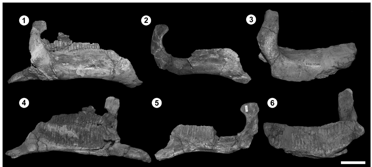
Figure 2. Dentaries. 1–3, lateral and, 4–6, medial views. 3, 6, morphotype 1: right dentary MPCA-Pv-SM7; 1–2, 4–5, morphotype 2: right dentaries, 1, 4, MPCA-Pv-SM3; 2, 5, MPCA-Pv-SM4. Scale bar= 5 cm.

Dentaries (Fig. 2). Hadrosaurid dentaries are characterized by a large number of tooth positions, the deflection angle of the symphyseal portion, the position of the coronoid process relative to the dental battery, among other characters (Xing