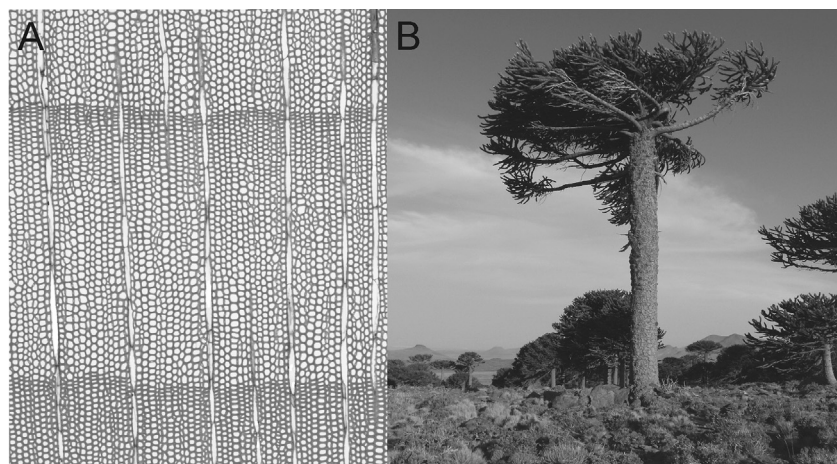
Fig. 1. A) Transverse section view of the A. araucana tree ring's anatomy and, B) the A. araucana forest stand at the Primeros Pinos study site.

Wood core samples were collected from Primeros Pinos (PP) (Fig. 1B) site, at the western side of Neuquén province in northern Patagonia, Argentina (38° 52'S, 70° 34'W) and at an elevation of 1628 m (Fig. 2). Dominant forests are open stands at the forest-steppe ecotone, growing in a rocky ground with a sandy matrix that provides a well-drained substratum. The regional climate is characterized by a mean annual air temperature of 12.4 °C (the mean of the warmest and coldest months are 19.8 °C and 5.1 °C, respectively), with the annual precipitation around 500 mm, although it is mainly concentrated in the winter months (De Fina, 1972).