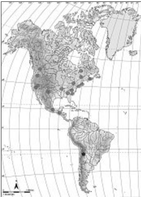
Fig. 5. Distribution of Cephaloziella hampeana in America. Previously known distribution in the Americas (grey dots) and current record from Argentina (black pentagon).

Unsurprisingly, species of both liverworts and mosses restricted to grasslands are found along high mountains within the Neotropics (Bischler-Causse et al. , 2005; Vanderpoorten & Goffinet, 2009; Suárez et al. , 2010; Flores & Suárez, 2015). Because of the presence of Cephaloziella in boreal and Antarctic areas, it is easy to consider this genus as a bipolar intermediate taxon (Bednarek-Ochyra et al. , 2000; Ochyra et al. , 2008). The nearly disjunct distribution between poles is commonly explained by the “American pathway” (Ochyra et al. , 2008). This is, the displacement between polar regions might have occurred along the high mountains within the tropics. Records within the South American tropics, including this new record of Cephaloziella hampeana , reinforce such a hypothesis. However, significant gaps remain with our knowledge of South American bryoflora (Matteri, 2000). This raises the question on the role of mountainous systems play in dispersing species throughout tropical South America. Many of the currently recognised disjunct distributions could actually be instances of continuous distributions along the high-mountain grasslands. The Andean uplift has been regarded as a crucial geological