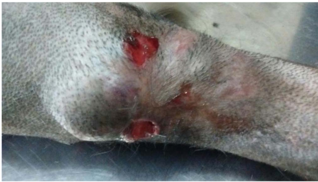
Fig. 1. Skin lesions in affected leg: alopecia, swollen and ulcerated vesicles.

to sustain the nursing of the puppies. Three months from the multiple birth (day 166) the patient presented the affected area (the same area of day 0) partially alopecic and slightly swollen, no samples were taken. A month later (day 196), the owner took the dog to the Micology Laboratory Service of the Faculty of Veterinary, National University of La Plata for consultation and sampling. At this moment, the dog presented the affected area clearly alopecic, swollen, with ulcerated vesicles, covered with a dry crust, under it, a serosanguineous exudate was observed (Fig. 1).