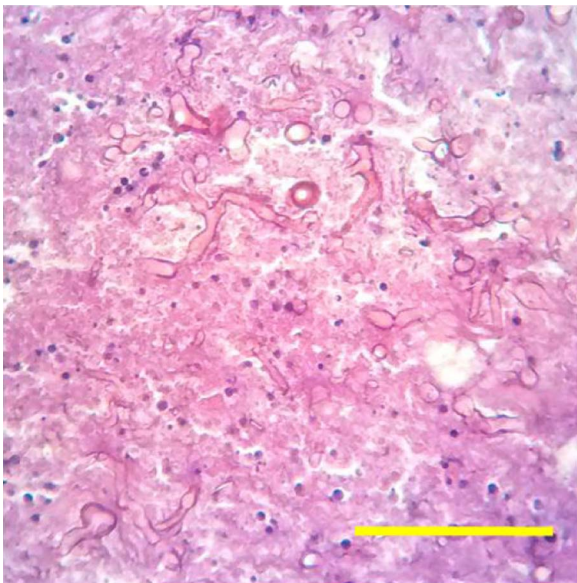
Fig. 2. Fungal hyphae with parallel walls and dichotomous to irregular branching are within the dermis. Hematoxylin and eosin stain, X400. Bar: 50 \mu\text{m} .

Culture of the exudates, and tissues from the biopsy, on Sabouraud dextrose agar (SDA), potato dextrose agar (PDA), blood agar and chocolate blood agar yielded, in all cases, an uniform population of a rapidly growing, white to light grey aerial fungal colonies, scarce sporangiospores on substrate and reverse colorless at both 37 °C and 25 °C in room air. These characteristics allowed us to suspect a mucormycosis, particularly the mucoralean genera that are reluctant to fruit on SDA or PDA, namely Apophysomyces and Saksenaea . In order