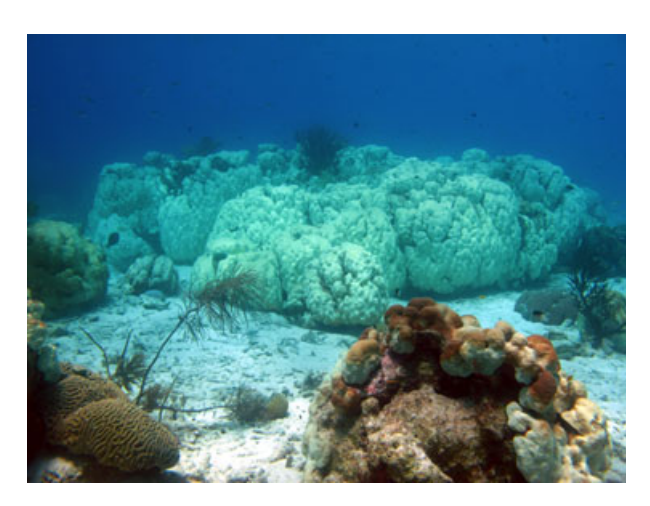
Fig. 2 A coral bleaching event. Bleaching events in the Caribbean Sea are becoming more frequent and severe.