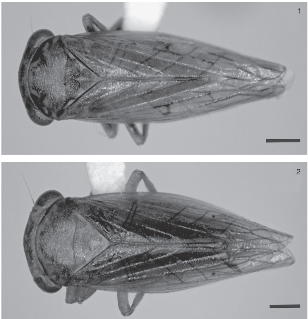
Figs. 1-2. Rhytidodus decimusquartus (Schrank). 1, male; 2, female. Scale: 1mm.

Subgenital plate (Fig. 10) elongated, narrow, lightly curved to half apex, expanded apically, extending beyond the pygofer, fine and short setae on the disc, very long and thin numerous setae, irregularly arranged forming a tuft at the apex rounded. Style (Fig. 8) narrow throughout its length, basal part strongly sclerotized, apophysis abruptly curved posteroventrally, apical third with microsetae on the outer margin, row of finer subapical macrosetae along inner margin, from start curved until apex, microsetae disperse on the disc, rounded denticles on the dorsal margin until third apical, apex with one sclerotized and curved spine (Fig. 9). Connective (Fig. 7)