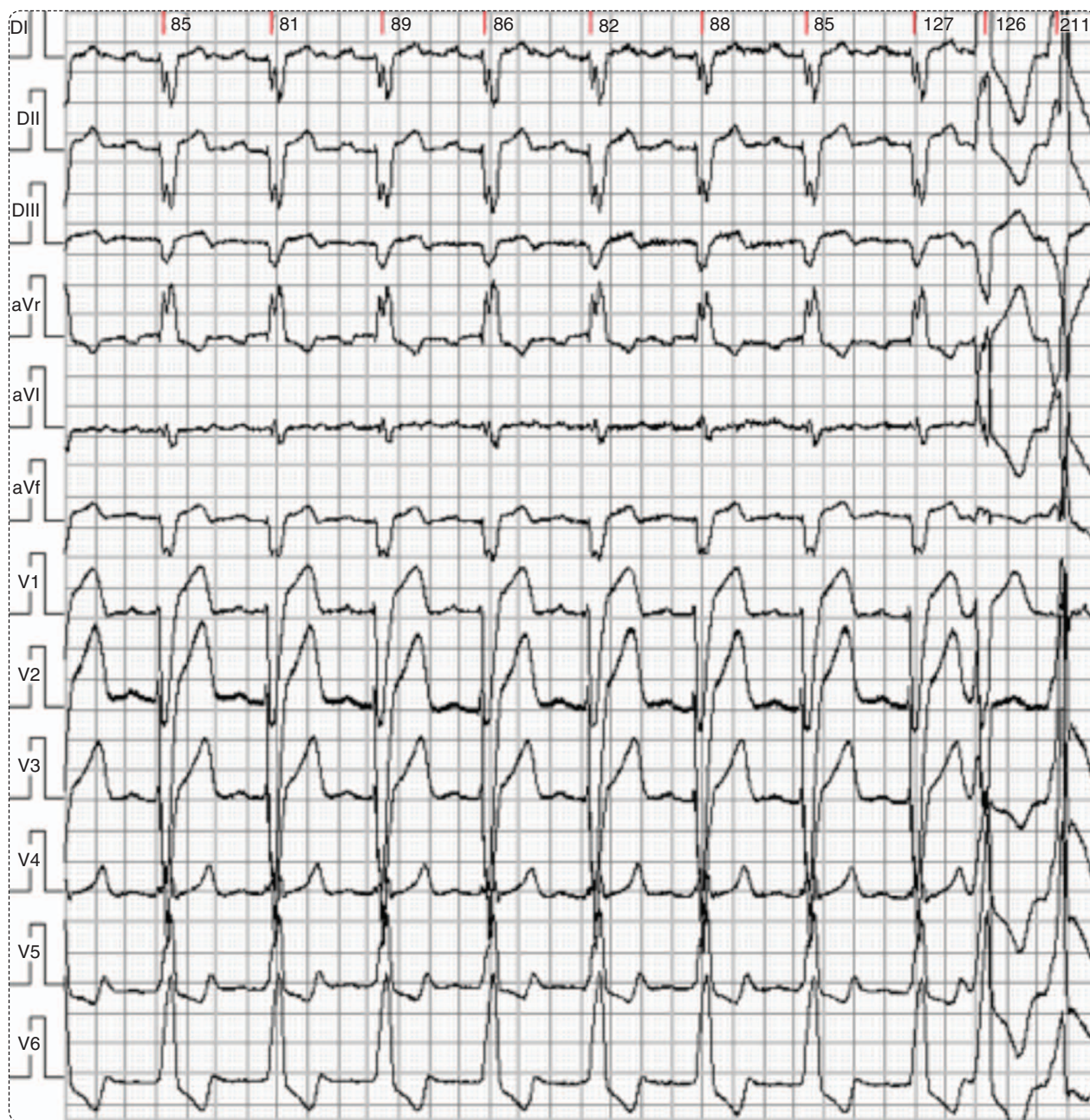
FIGURE 3 The simultaneous digital 12-lead ECG records. The records were taken by one of the authors at the IIBM-UBA using ECOSUR-SA equipment (Buenos Aires, Argentina). The vectorcardiogram is easily derived by a mathematical transformation, as explained in the text.

vector. Still in another wording, the ventricular gradient is a single vector quantity which defines the mean difference in magnitude and direction of the excited state duration and the electric potential recovery for the entire electrical ventricular beat.