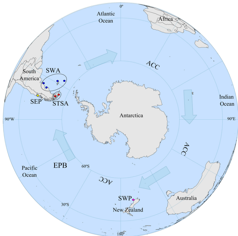
Fig. 1 Study locations included in the phylogeographic analysis of Munida gregaria . SEP southeast Pacific, STSA southern tip of South America, SWA southwest Atlantic, SWP southwest Pacific. Arrows indicate the approximate position of the Antarctic Circumpolar Current (ACC). EPB East Pacific Barrier

Cytochrome oxidase subunit I and ND1 sequences were edited and aligned independently using BioEdit version