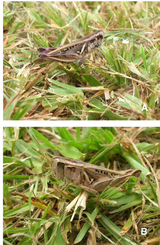
Figure 2. Dichroplus obscurus , Male (A) and Female (B), collected in Posadas.

specified in their publication, according to the maps showed (see their Figures) it would correspond to “San Javier-San José, Pindapoy” (Figure 1, white circle in the map) where also a specimen of D. vittatus (another species of the Maculipennis group) was apparently collected. However, D. vittatus is a typical dweller of dry and arid environments, contrary to the Misiones location indicated in Cigliano and Otte (2003), which may suggest that Jorgensen erroneously cited this specimen’s location. It also suggests that this may be the case for the Misiones specimen of D. obscurus .