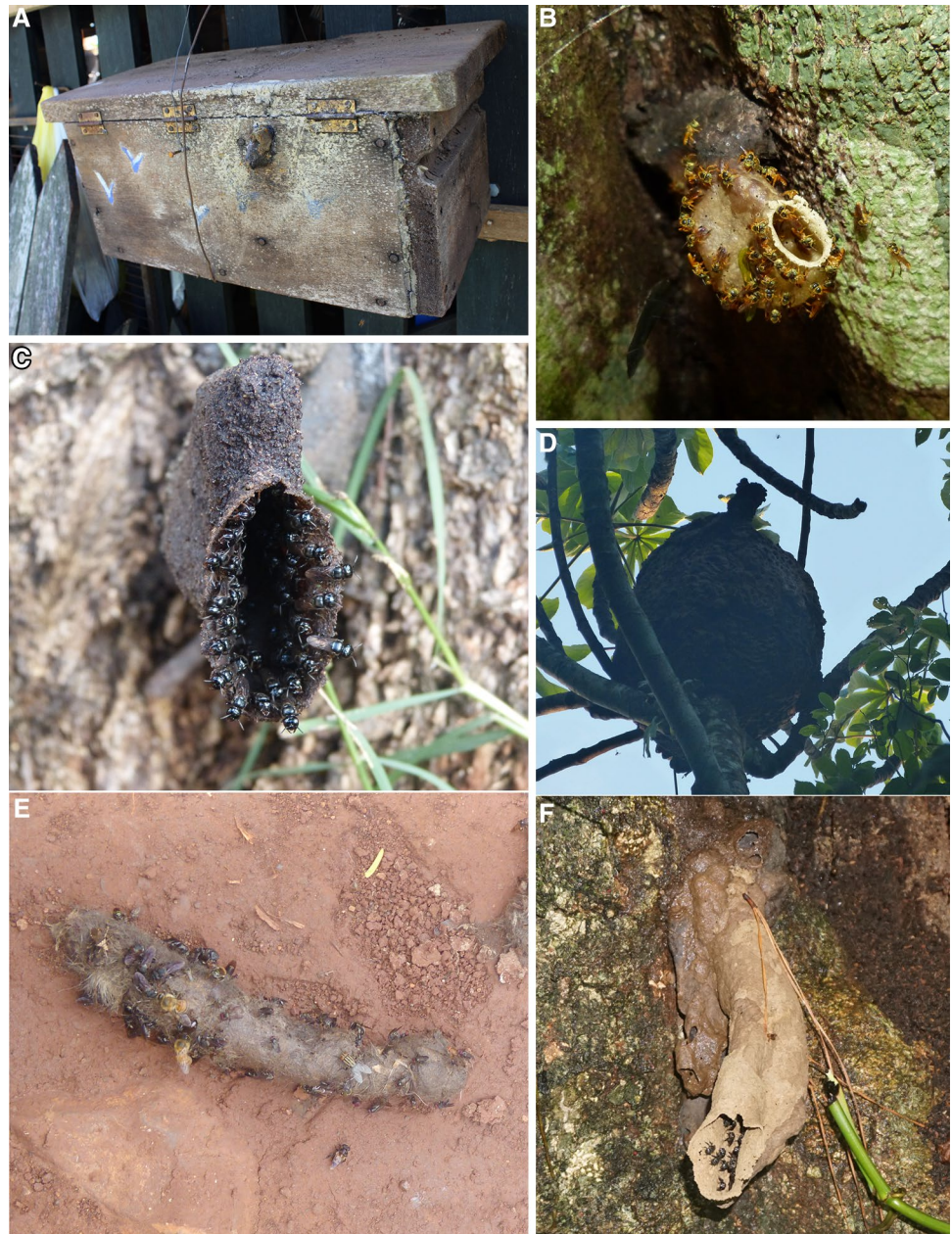
Fig. 2 Examples of substrates where stingless bees were collected. a Hive of Tetragonisca fiebrigi in a meliponary; b natural nest of T. fiebrigi inside tree trunk; c entrance of natural nest of Lestrimelitta chacoana on tree trunk; d aerial external nest of Trigona spinipes ; e foragers stingless bees and honey bees on feline fecal matter; f nest entrance of Scaptotrigona aff. postica in a tree trunk

final extension of 5 min at 72 °C. The amplified product was analyzed using 2% agarose gel electrophoresis and ethidium bromide staining. The positive PCR products were purified using a gel extraction kit (Wizard® SV Gel&PCR Clean Up, Promega Madison, Wisconsin, USA) and sequenced (Biotechnology Resource Center, University of Cornell, Ithaca, USA). The sequences were analyzed using Basic Local Alignment Search Tool (BLAST) software.