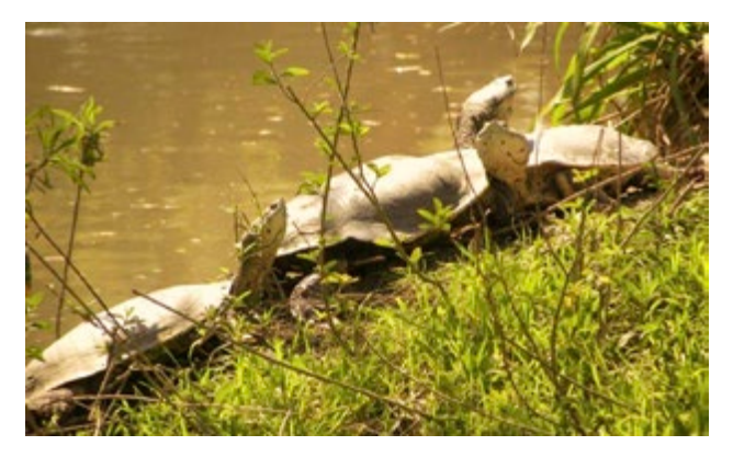
Fig 1. Adult specimens of Phrynops hilarii (approximately 4-5 kg).

counts, differential leukocyte count (DLC), Ht and Hb.