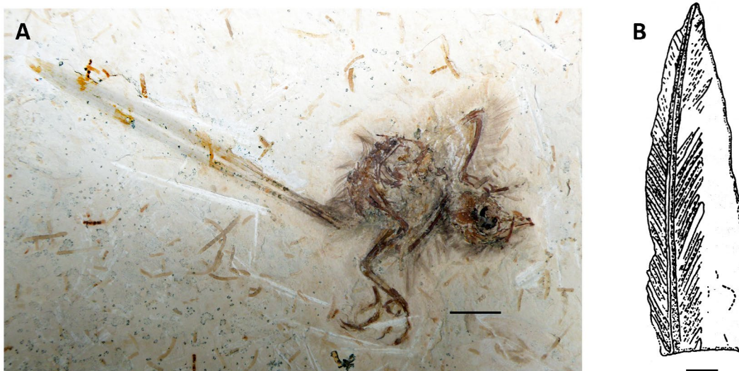
Figure 1. A, Holotype of Cratoavis cearensis (UFRJ-DG 031), B, Original illustration of Praeornis (modified from Rautian 1978).

In this way, Praeornis cannot be distinguished by any character of its gross or detailed morphology from the rachis-dominated like feathers reported in several basal birds (O’Connor et al. 2012).