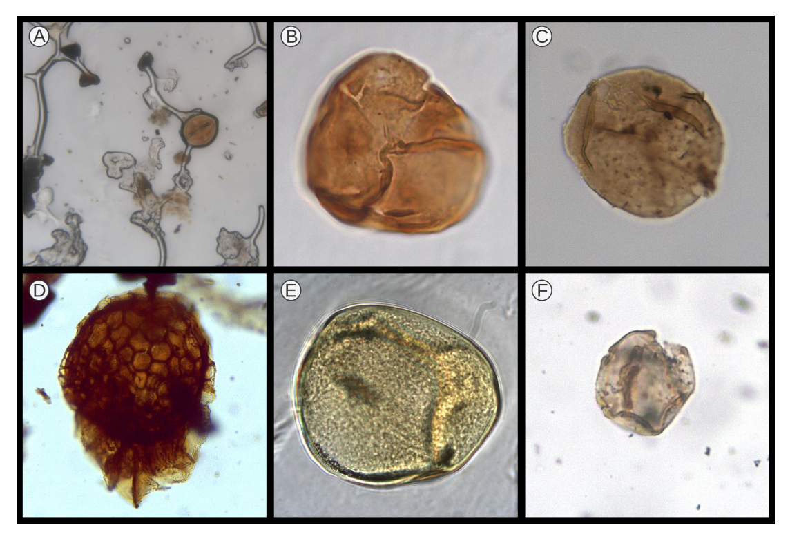
Fig. 2. Samples of palynological specimens mounted with UV-curable acrylates. A. Palynological slide mounted with glycerin jelly altered by air dendrites after ten years. B. Fossil spore mounted with Trabasil ® NR2 (photographed with a 100x objective). C. Fossil spore mounted with Acrysoft ® UV mounting media T (photographed with a 100x objective). D. Fossil spore mounted with Trabasil ® NR2 (photographed with a 40x objective). E. Extant pollen (without acetolysis) mounted with Trabasil ® NR2 (photographed with a 40x objective). E. Fossil pollen mounted with Acrysoft ® UV mounting media S (photographed with a 40x objective).

the m.m. to higher temperatures (e.g. glycerin jelly) in order to achieve a manageable consistency.