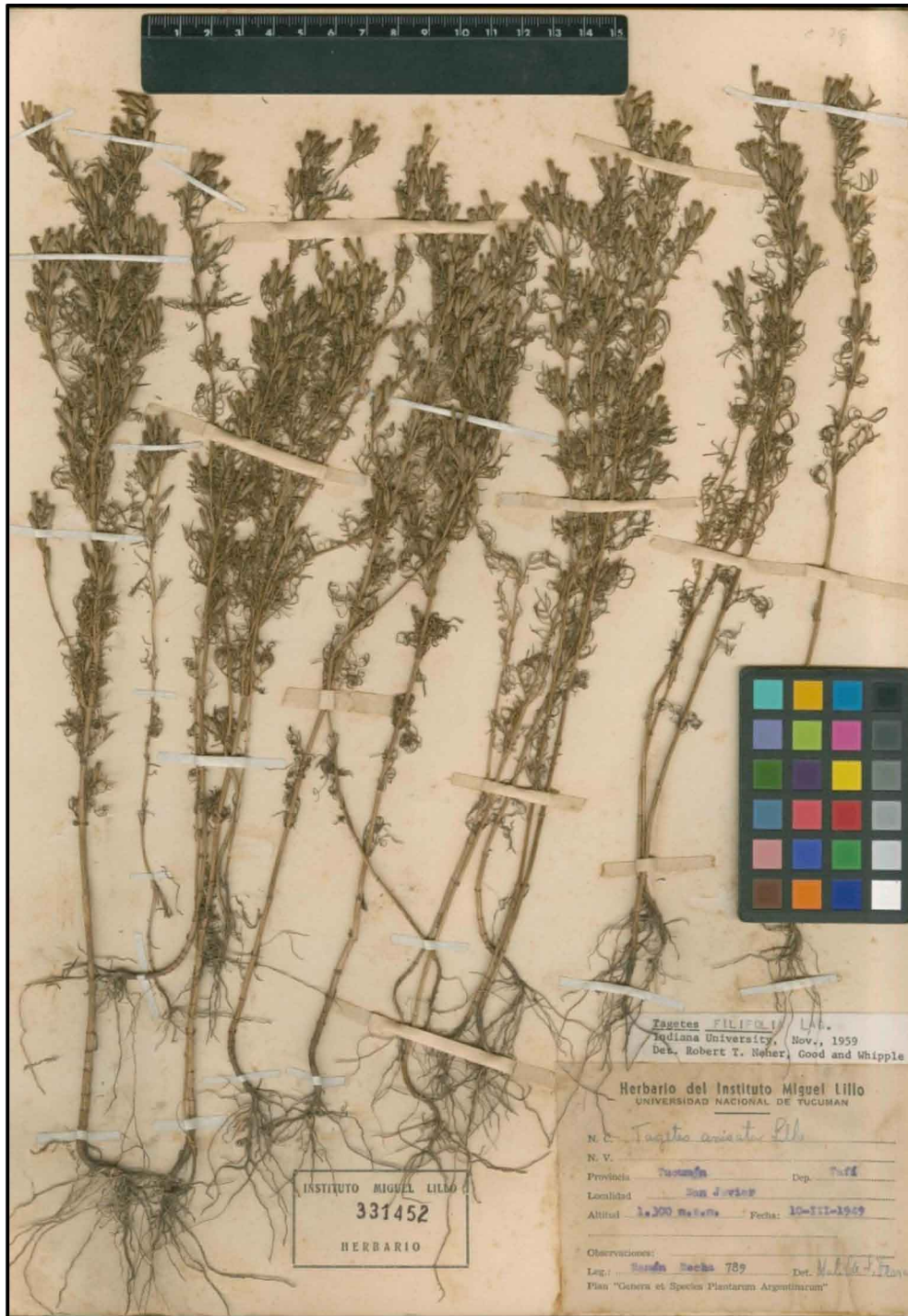
FIGURE 2. Epitype of Tagetes anisata Lillo.

2. Tagetes bonariensis Persoon (1807: 459). Type:—ARGENTINA. “Hab. in Bonaria” [Buenos Aires city and surrounding area], “Commers.” [ P. Commerson ] s.n. (lectotype here designated, L 1589044 [photo! “Buenos Ayres”])