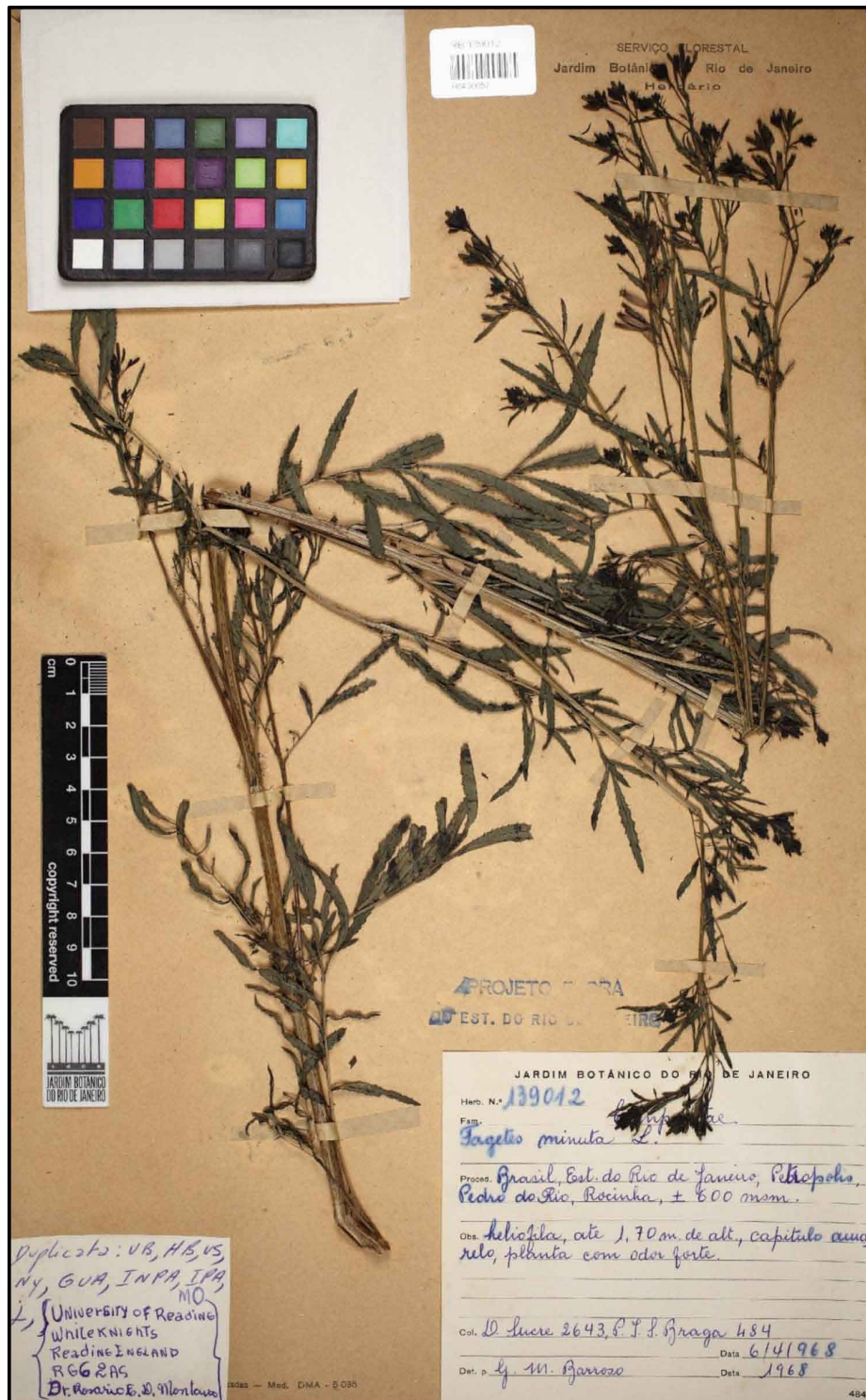
FIGURE 3. Epitype of Tagetes porophyllum Vell.

Tagetes porophyllum is a synonym of T. minuta (e.g. Neher 1966, Gutiérrez & Stampacchio 2015). Tagetes porophyllum was originally an invalid name (Vellozo 1831), validated later (Vellozo 1881). Gutiérrez & Stampacchio (2015) designated an original illustration (Vellozo 1831) as lectotype. For the purposes of precise application of the name of this species, an epitype is here designated. This specimen, kept at RB (Fig. 3), fits accurately with the diagnosis and illustration of the species.