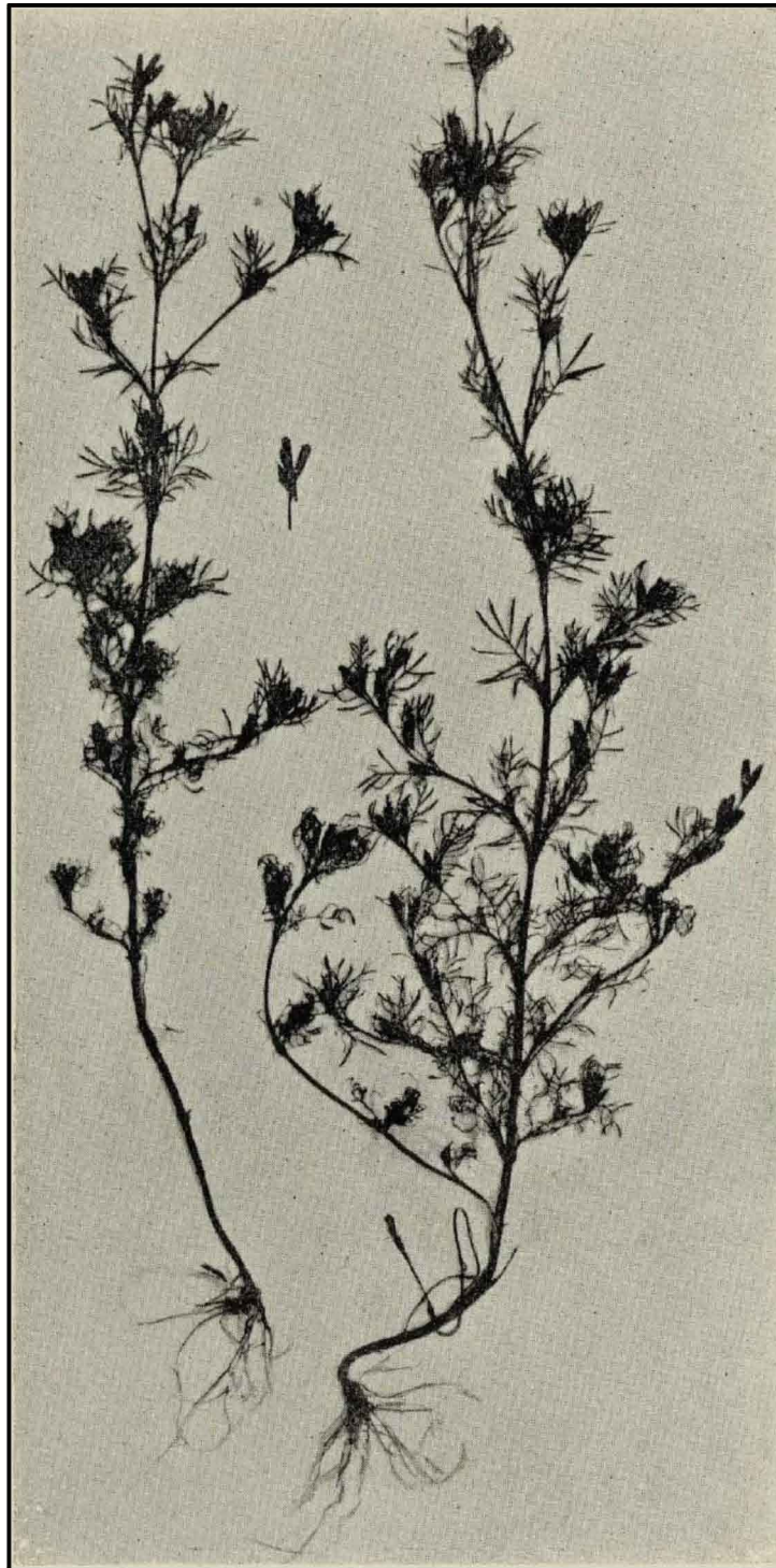
FIGURE 1. Lectotype of Tagetes anisata Lillo.