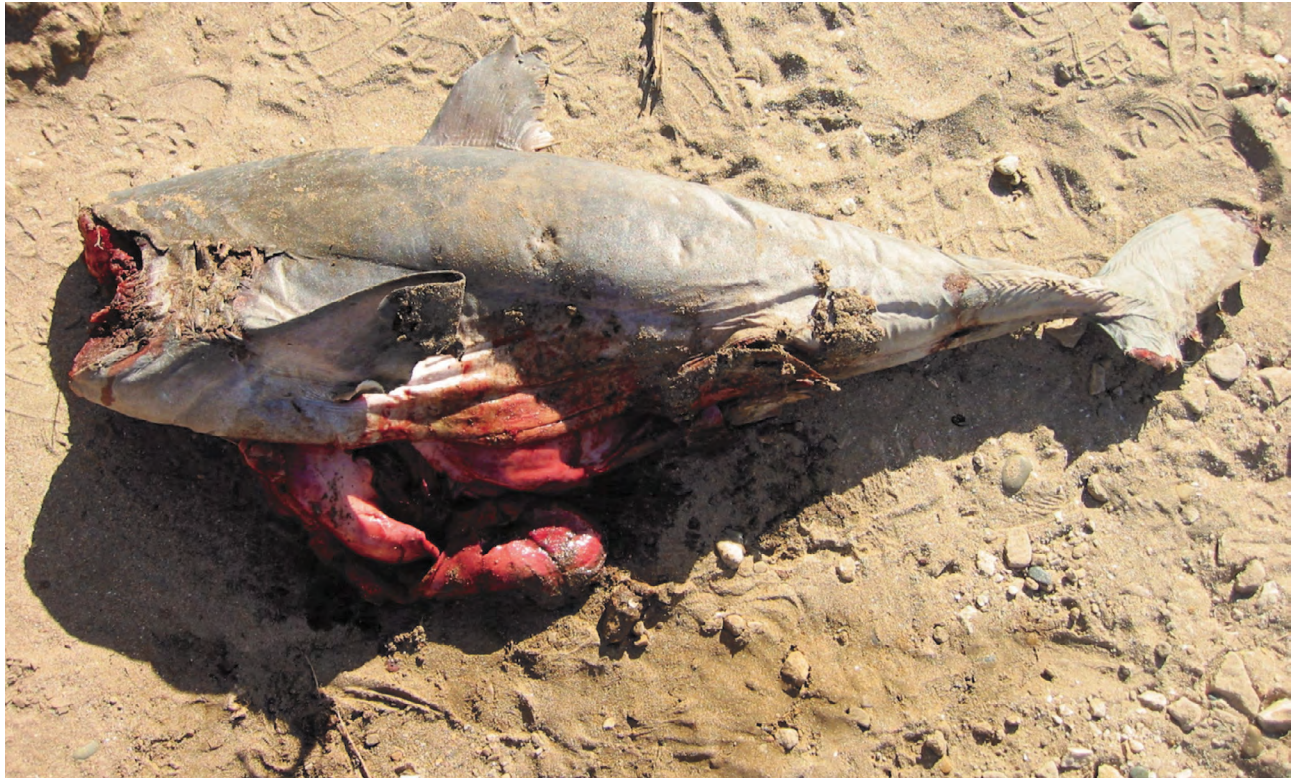
Figure 1. Specimen of Lamna nasus found at Chapadmalal beach (Argentina).

identification and a minimum sequence length of 500bp), our specimen (UNMDP 1511/FARG 664-09) matched Lamna nasus with a similarity range of 98.62% - 100% ( n = 99 ). The database contains specimens collected all over the world, including both the southern (SH) and northern hemisphere (NH). All records fall into the same BIN, BOLD:AAA3577 (if there were different BINs within a set of specimens, putatively of the same species, it would indicate that specimens may represent different cryptic species, or there is unusually large genetic variation within a species, or, most commonly, there are misidentifications in the database).