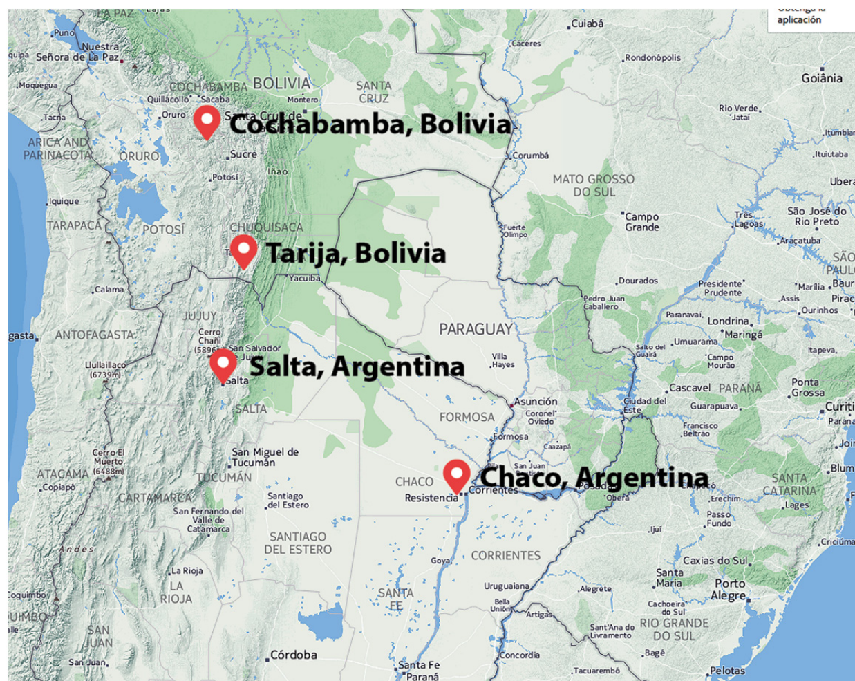
Figure 2. Geographic location of deltamethrin-resistant T. infestans in Argentina and Bolivia

The toxicological and biochemical studies on insecticide resistant in field populations of Argentina and Bolivia, demonstrated different mechanisms (Santo-Orihuela, Vassena, Zerba, & Picollo, 2008; Toloza et al., 2008). These studies identified at least three resistant profiles named Ti-R1, Ti-R2 and Ti-R3, for the Argentinean Acambuco, and the Bolivian populations Entre Ríos and Mataral respectively (Roca-Acevedo, Picollo, Capriotti, Sierra, & Santo-Orihuela, 2015; Gonzalo Roca-Acevedo, Picollo, & Santo-Orihuela, 2013) (Figure 3).