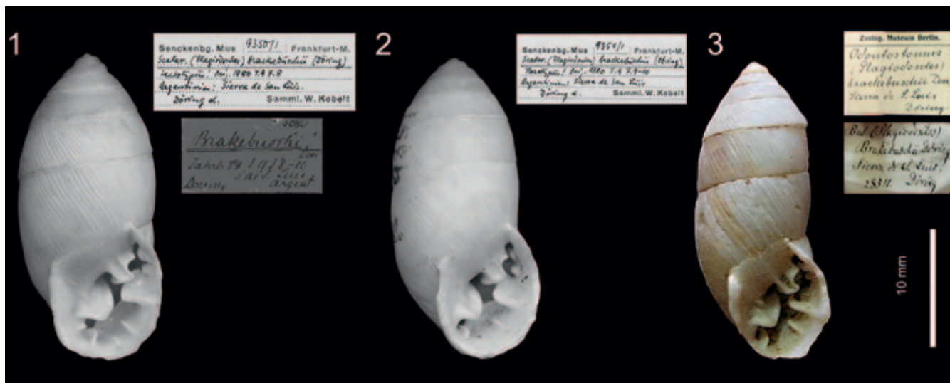
Figures 1–3 Type series of Plagiodontes brackebuschii (Doering 1877). Fig. 1 lectotype designated by Zilch (1971): SMF 9350/1. Fig. 2 paralectotype designated by Zilch (1971): SMF 9351/1. Fig. 3 paralectotype designated by Breure (2013): ZMB 28511.