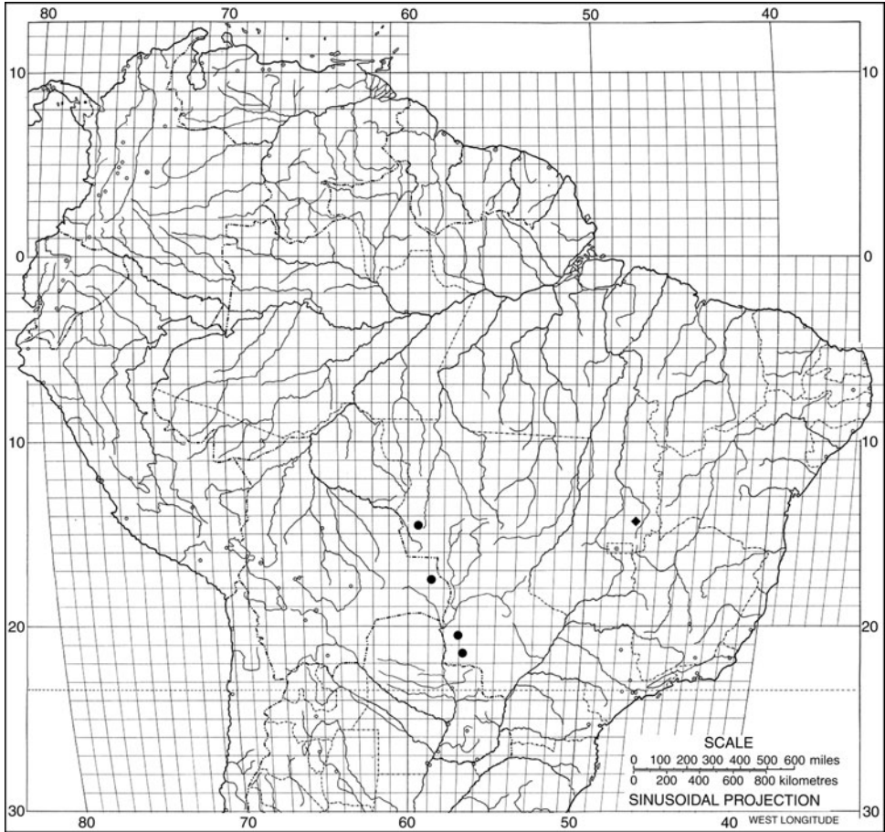
FIG. 2. Geographic distribution of Lessingianthus arctatus (●) and L. longicuspis (◆).

Flowering and fruiting. The single available collection was made in July, which is not common in the genus Lessingianthus , because almost all the species flower and fruit during the summer, between December and March.