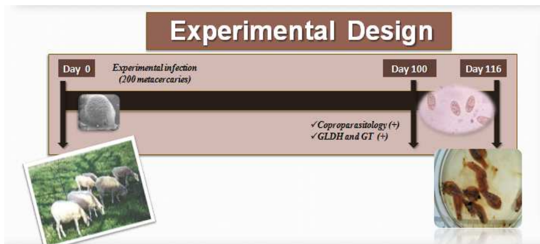
Fig. 3. Experimental Design: At day 0, each lambs free of parasites were infected orally with 200 metacercariae of F. hepatica contained in a gelatin capsule. The infection was confirmed 14 weeks later (Day 100 pt.) by the presence of eggs in feces and the indirect estimation of liver damage was determined by measuring the levels of the serum enzymes GLDH and GT. The adult flukes were collected of the bile ducts and liver (Day 116 pt.)